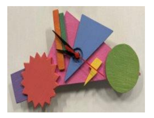
Year 9 – Memphis inspired clock

I would like to share just a few of the amazing pieces of work that year 9 have completed this year. Our students have made the DT team very proud of all their creative ideas and the quality of work they are producing.